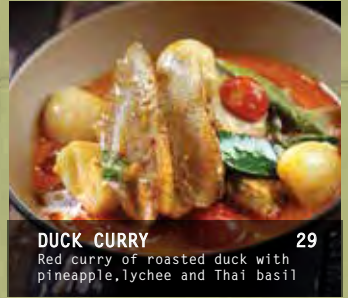
DUCK CURRY 29 Red curry of roasted duck with pineapple, lychee and Thai basil