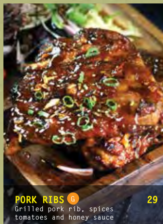
PORK RIBS 6 29 Grilled pork rib, spices tomatoes and honey sauce