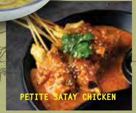
PETITE SATAY CHICKEN