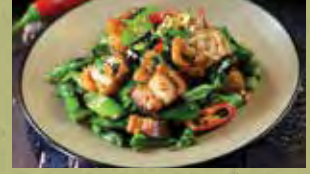
KA NA MOO GROB 🌶️ 24 Stir fried crispy pork with garlic, chilli and Chinese broccoli