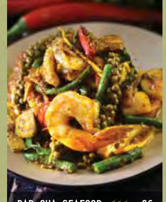
PAD CHA SEAFOOD 🌶️ 🌶️ 26 Spicy stir-fried of combination seafood, fresh herbs, chilli & basil