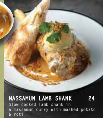
MASSAMUN LAMB SHANK 24 Slow cooked lamb shank in a massamun curry with mashed potato & roti