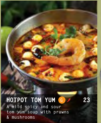
HOTPOT TOM YUM 🍷 🌶️ 23 A mild spicy and sour tom yum soup with prawns & mushrooms