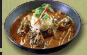
MASSAMUN 🍷 BEEF CURRY 23 Braised beef in massamun curry with mashed potato