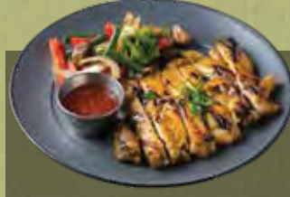
GRILLED CHICKEN 24 Char grilled marinated chicken thigh fillet with Asian salad