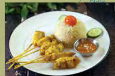
LITTLE CHICKEN FRIED RICE 12 Thai fried rice with egg served with marinated chicken skewer and peanut sauce