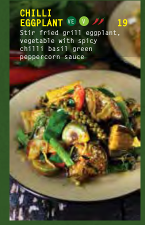
CHILLI EGGPLANT 🌿 🌿 🌶️ 19 Stir fried grill eggplant, vegetable with spicy chilli basil green peppercorn sauce