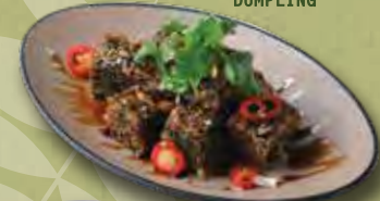
GARLIC CHIVE DUMPLING