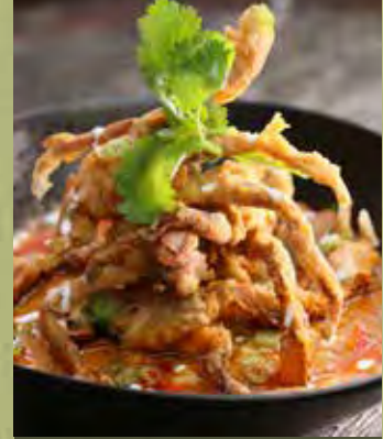
CHILLI JAM SOFT SHELL CRABS 27 Crispy soft shell crab with homemade mild chilli jam sauce