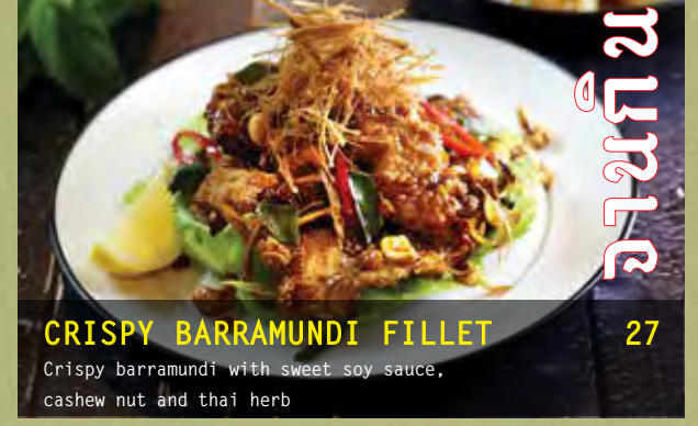
CRISPY BARRAMUNDI FILLET 27 Crispy barramundi with sweet soy sauce, cashew nut and thai herb