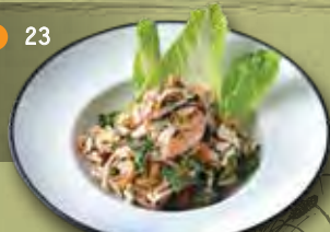
COCONUT SALAD 6 23 Poached chicken, prawn, cashew nut and Thai herbs with coconut milk dressing