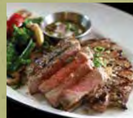
GRILLED BEEF 6 28 Char grilled beef with wok tossed mix vegetable