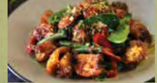
PAD PRIK KHING 🌶️ 26 Stir fried crispy pork with chilli kaffir lime jam and green bean