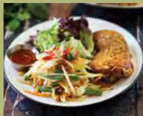
PAPAYA 6 CRISPY CHICKEN 24 Crispy chicken maryland served with papaya salad