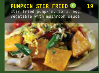
PUMPKIN STIR FRIED 🌿 19 Stir fried pumpkin, tofu, egg, vegetable with mushroom sauce